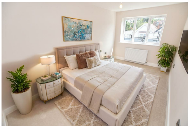
Bedroom One 15'5" x 8'6" (4.70m x 2.59m)

White gloss vanity unit with inset wash hand basin and cupboard under. wall mounted mirror above wash hand basin. White gloss unit concealing cistern for close coupled W.C. spacious walk-in shower, fully tiled walls, chrome towel rail/radiator, extractor fan, non slip vinyl flooring, smooth finished ceiling with inset lighting.